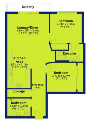
Total area: approx. 60.2 sq. metres (648.2 sq. feet)