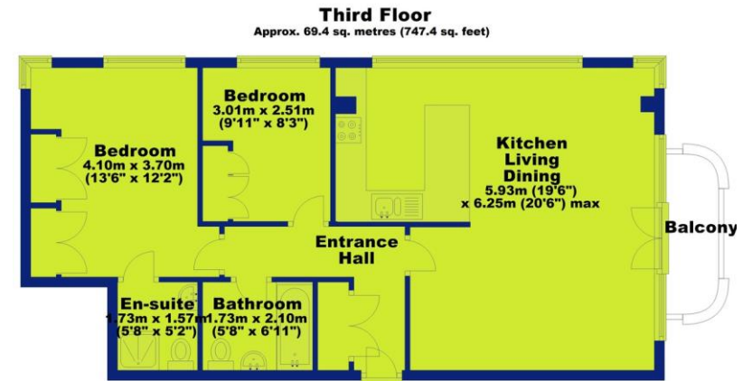
Total area: approx. 69.4 sq. metres (747.4 sq. feet)

Residents also enjoy the convenience of an on-site gym and an additional storage unit, providing extra functionality and lifestyle perks.