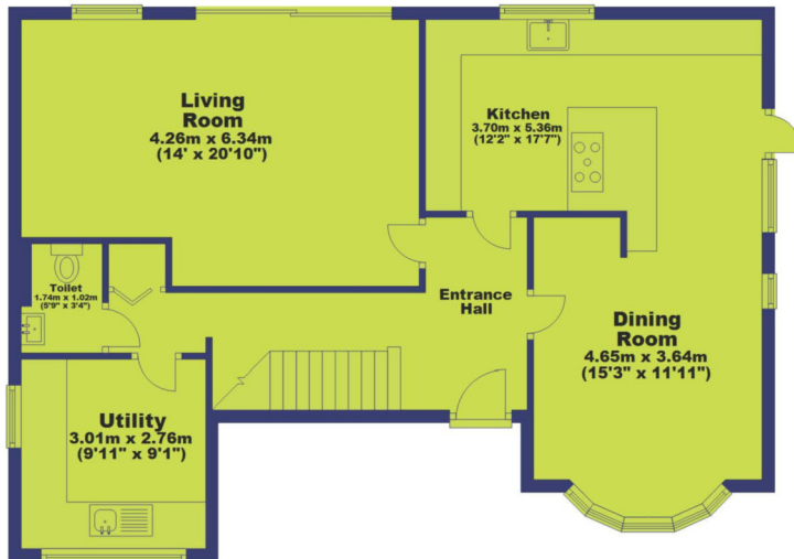
Ground Floor Approx. 84.1 sq. metres (905.0 sq. feet)