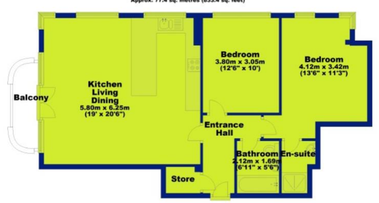
Total area: approx. 77.4 sq. metres (833.4 sq. feet)