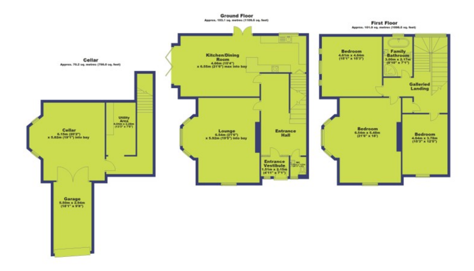
Total area: approx. 275.2 sq. metres (2962.0 sq. feet)