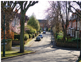
Trees Lined Avenues