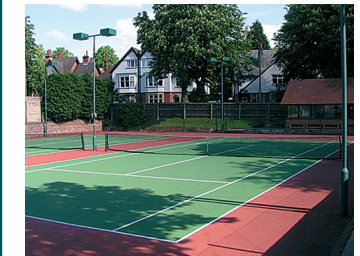
Mapperley Hall Drive