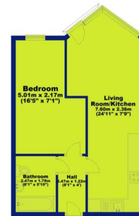
Total area: approx. 44.2 sq. metres (476.3 sq. feet)

Interested in this home? Contact the FHP Living Team on 0115 841 1155