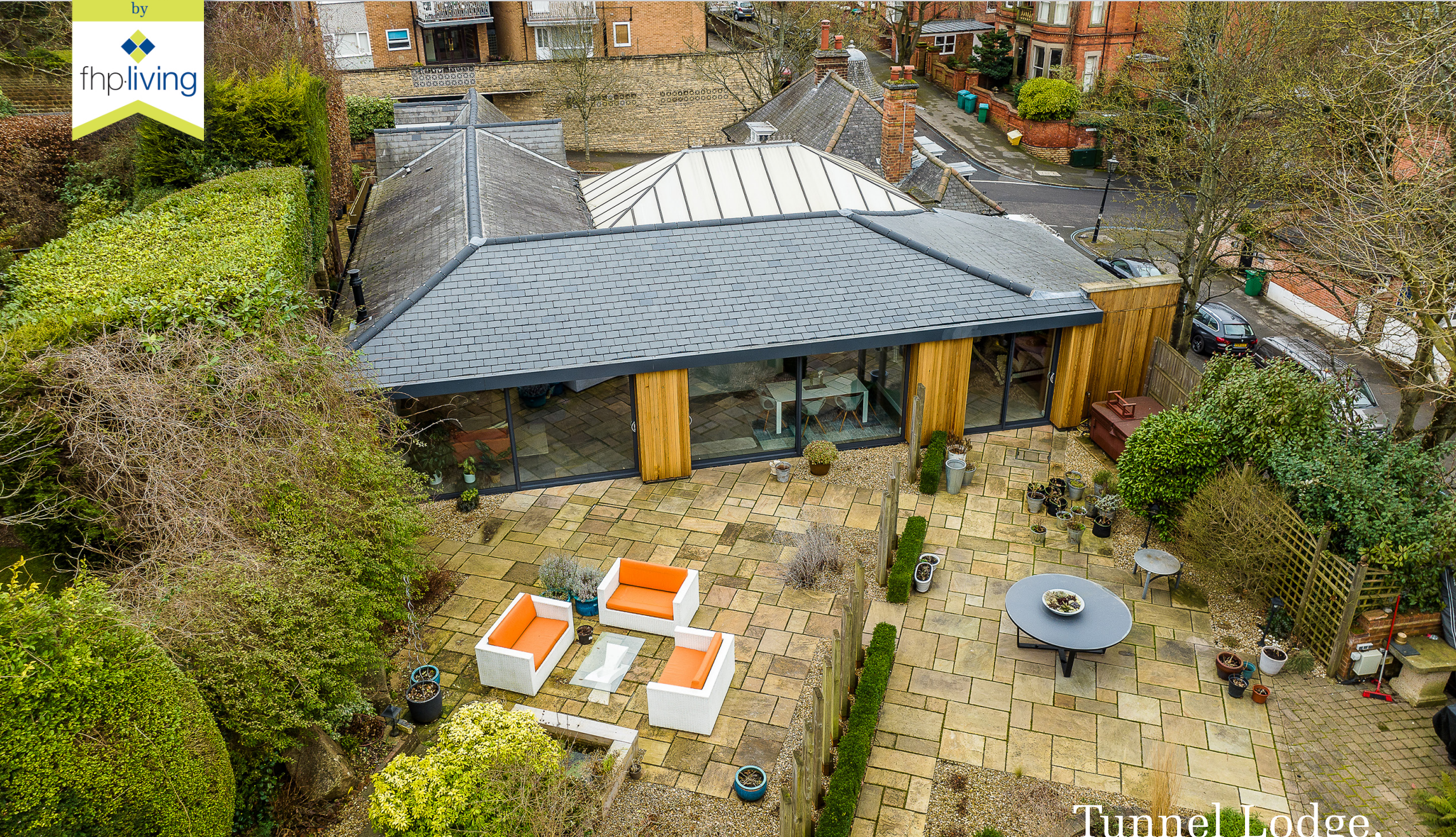
Tunnel Lodge, Tunnel Road, The Park, NG7 1BN