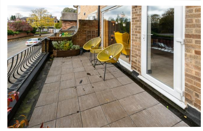
First Floor Approx. 50.4 sq. metres (542.0 sq. feet) Dining Afrea 2.63m x 2.42m (88" x 711") Ritchen 3.44m (113") max x 4.86m (15"1") Lounge 5.45m x 3.83m (17"11" x 127") Reception Room C 3.59m x 3.02m (11"9" x 9"11") Balcony 2.22m x 5.04m (7"3" x 166")