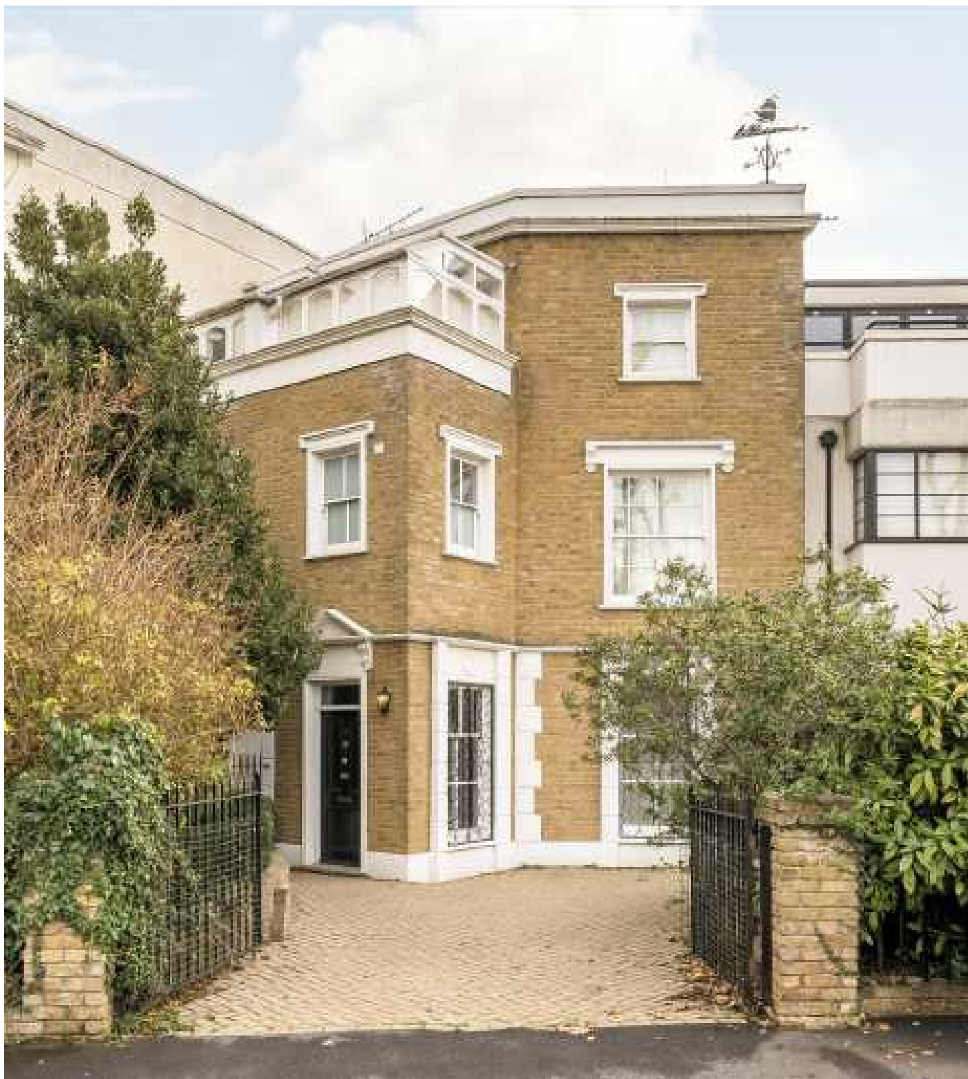
Honor Oak Rise, SE23 £1,100,000