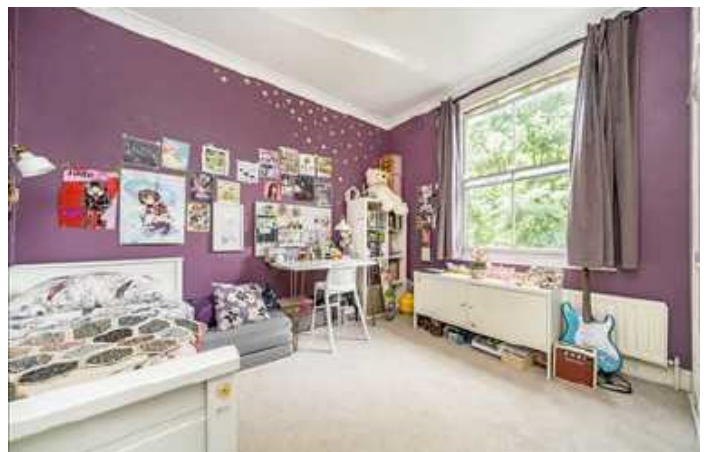
Devonshire Road, SE23