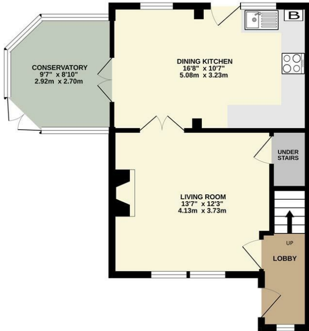
GROUND FLOOR 466 sq.ft. (43.3 sq.m.) approx.