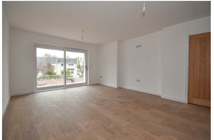
Dining Kitchen 11'5 x 12'9 (3.48m x 3.89m)