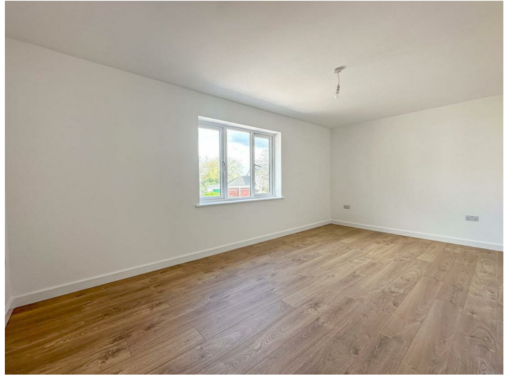
Bedroom Two 11'2 x 12'10 (3.40m x 3.91m)