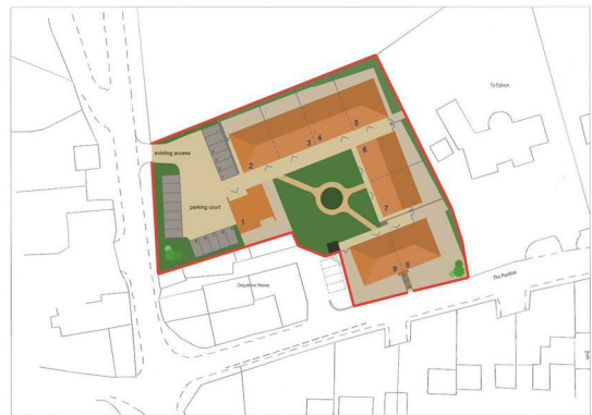
Site Masterplan, Site at Graystone House, Stalton Scale 1:10000