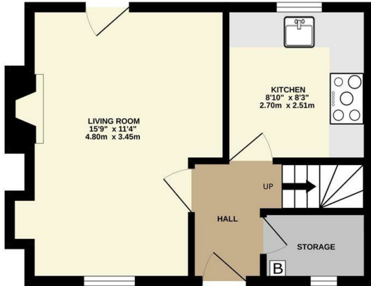
GROUND FLOOR 310 sq.ft. (28.8 sq.m.) approx.