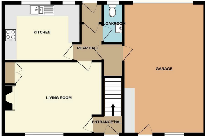
GROUND FLOOR 742 sq.ft. (69.0 sq.m.) approx.