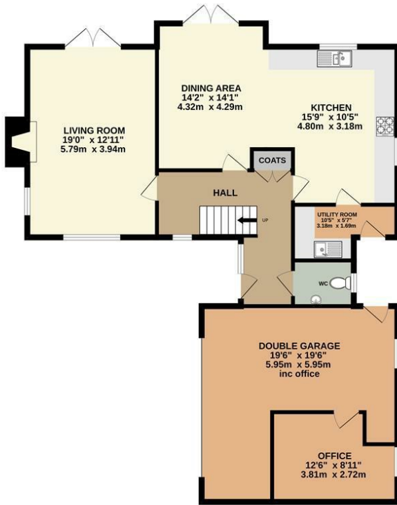
GROUND FLOOR 1182 sq.ft. (109.8 sq.m.) approx.