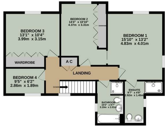
1ST FLOOR 798 sq.ft. (74.2 sq.m.) approx.