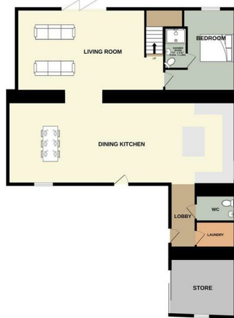
GROUND FLOOR 1377 sq.ft. (128.0 sq.m.) approx.