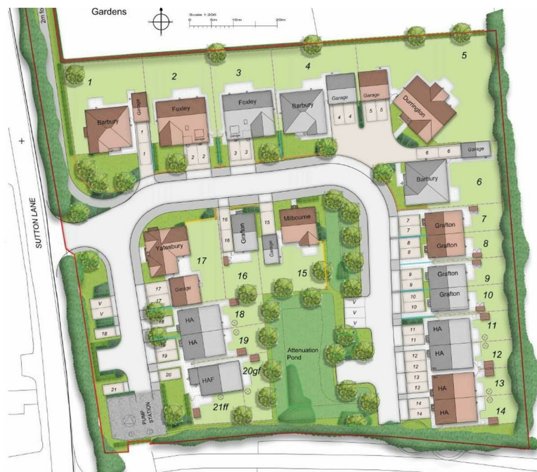
Garden Close, Sutton Benger