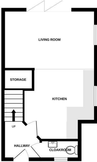
GROUND FLOOR 348 sq.ft. (32.3 sq.m.) approx.