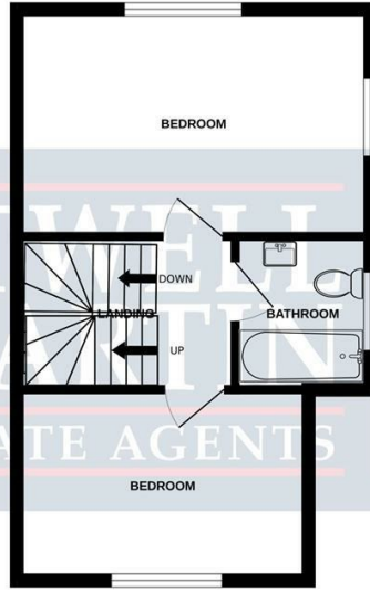
1ST FLOOR 342 sq.ft. (31.8 sq.m.) approx.