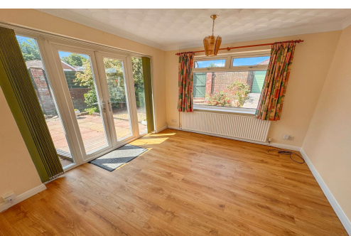
34 St James Road, West End