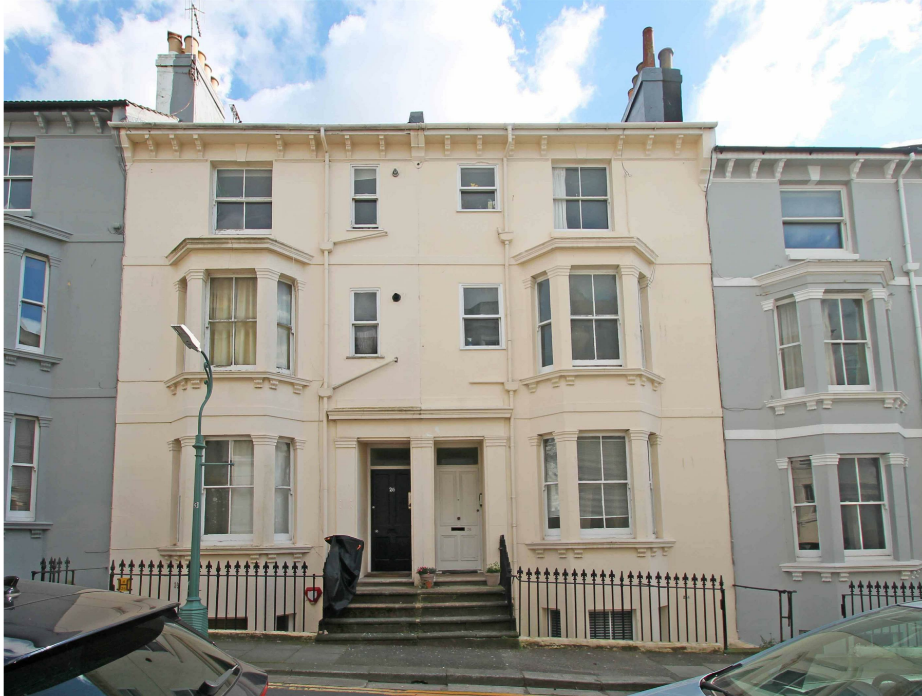
Lansdowne Street, Hove, BN3 1FQ £230,000 - £250,000 Guide