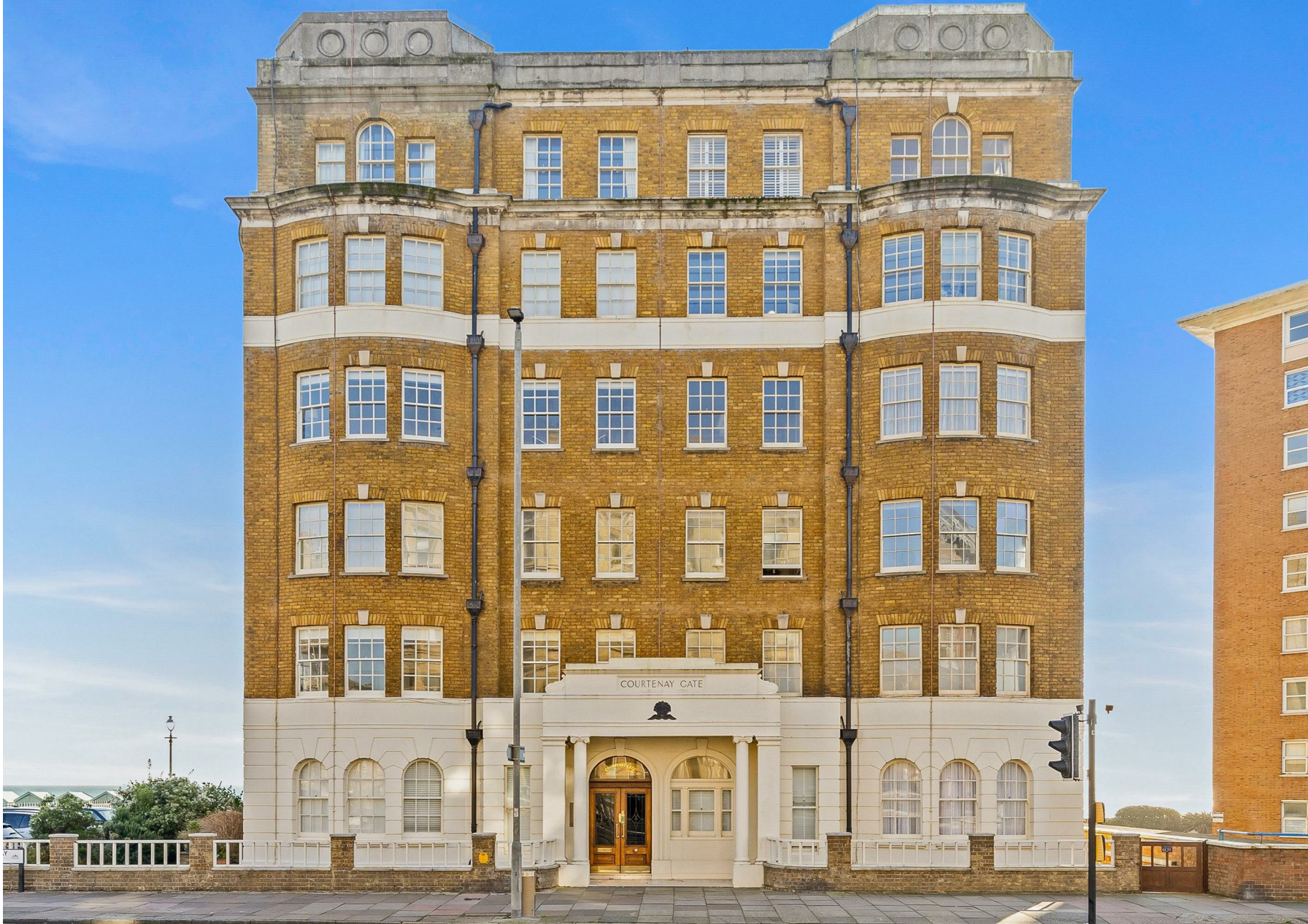
Courtenay Gate, Courtenay Terrace, Hove, BN3 2WJ £550,000