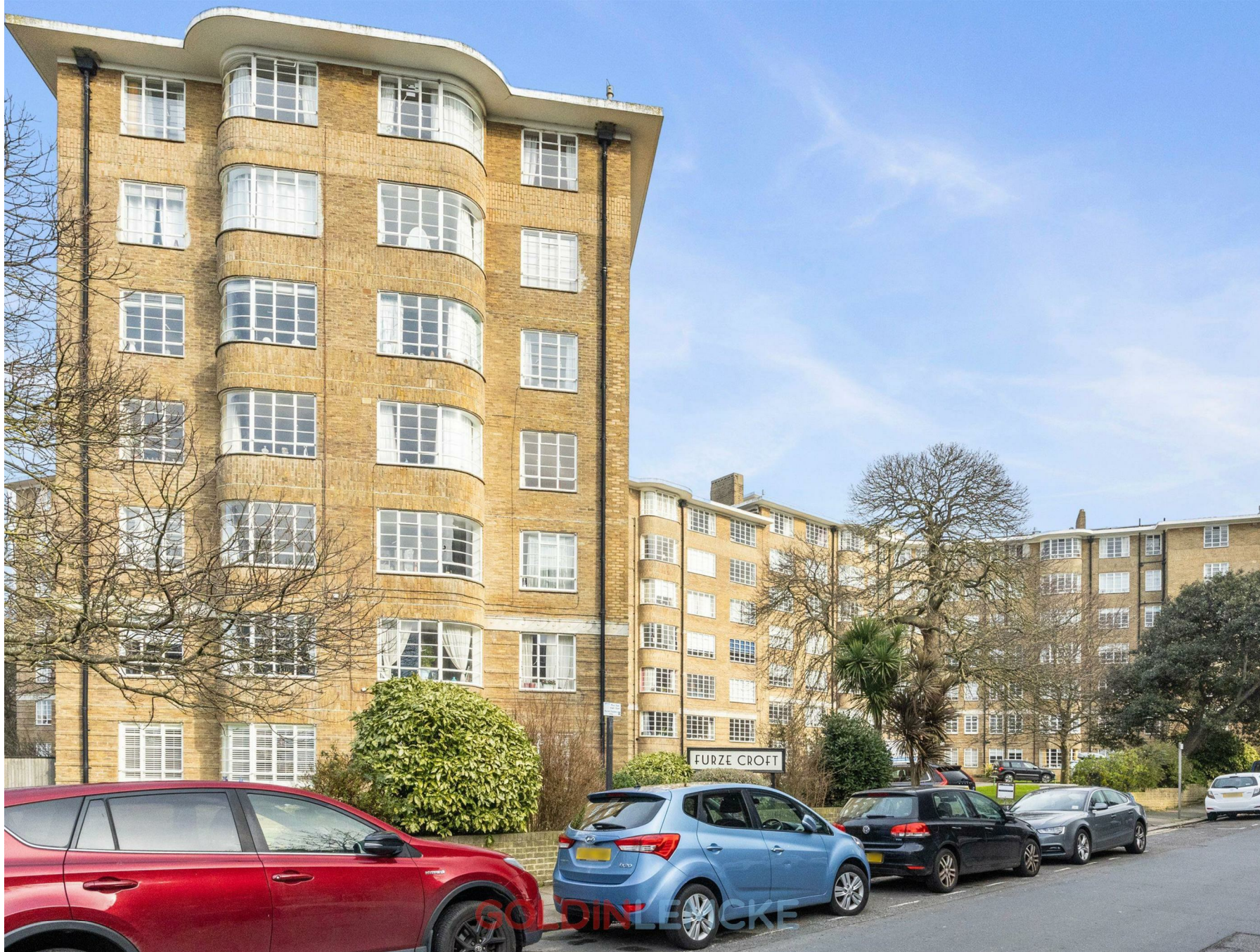
Furze Croft, Furze Hill, Hove, BN3 1PB £300,000 - £325,000 Guide