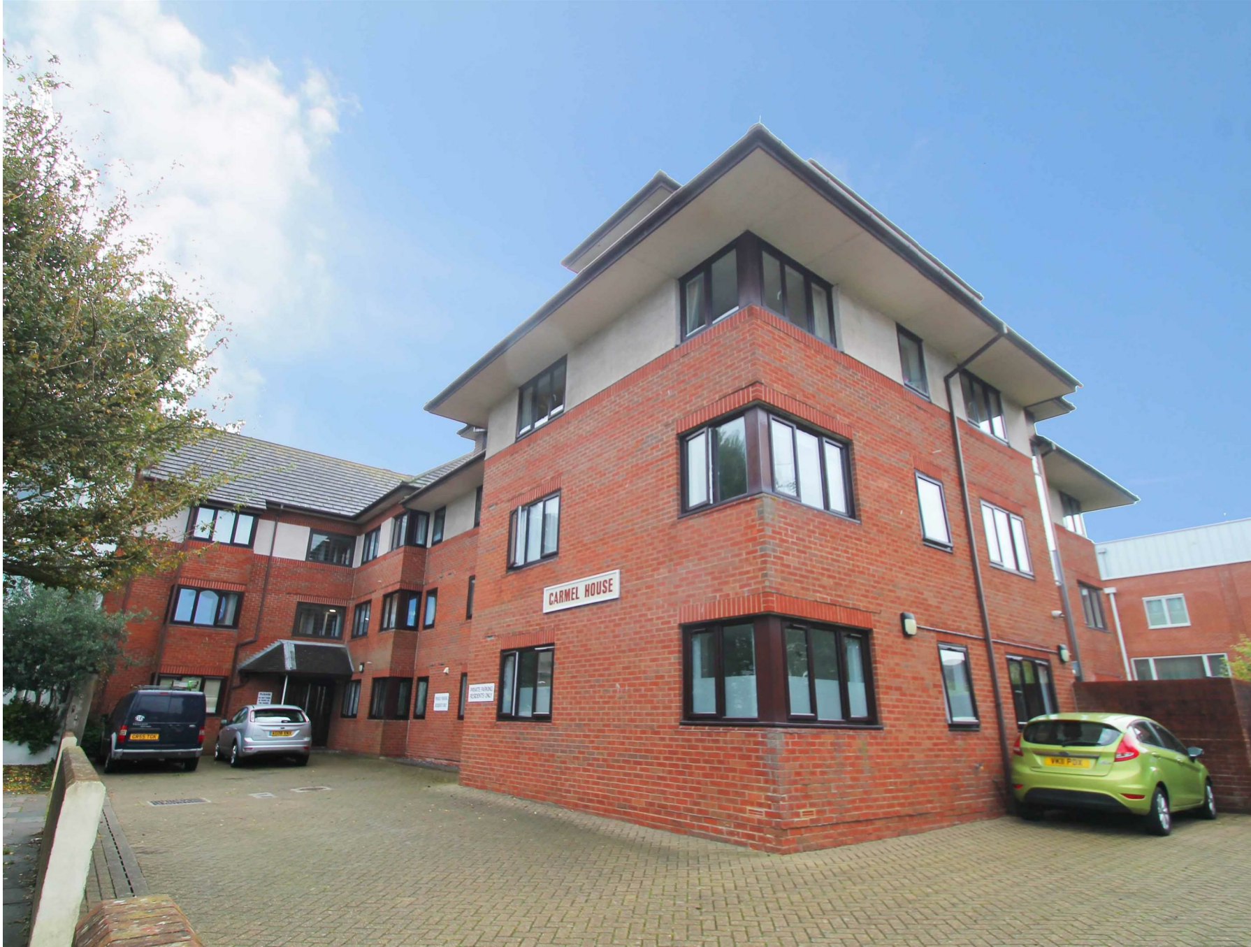
Carmel House, Westbourne Street, Hove, BN3 5PE £200,000