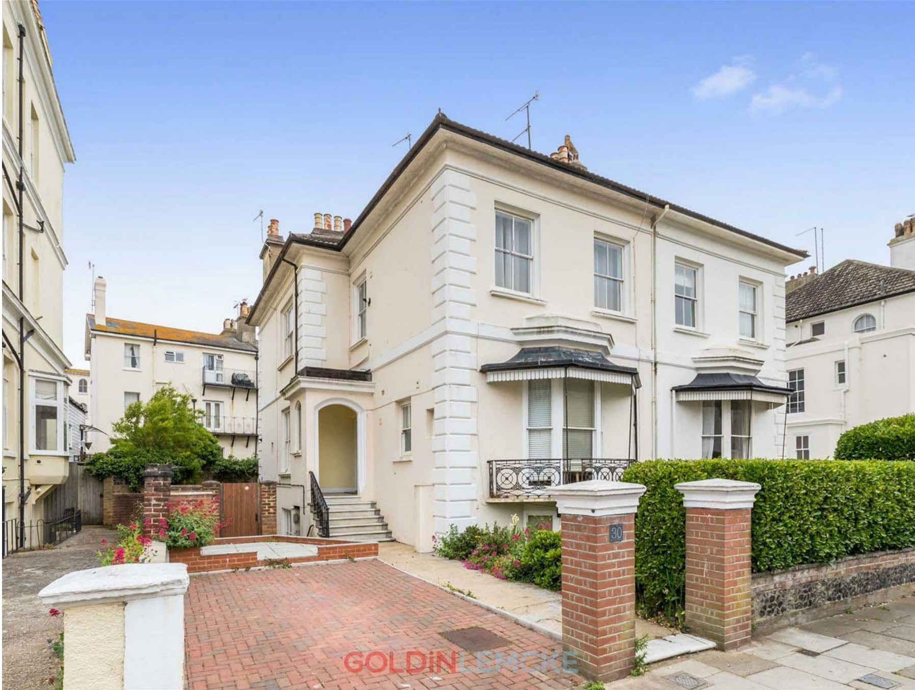
Medina Villas, Hove, BN3 2RN £700,000