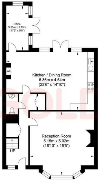
Ground Floor Approximate Floor Area 742.27 sq ft (68.96 sq m)