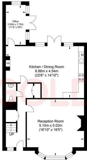
Ground Floor Approximate Floor Area 742.27 sq ft (68.96 sq m)