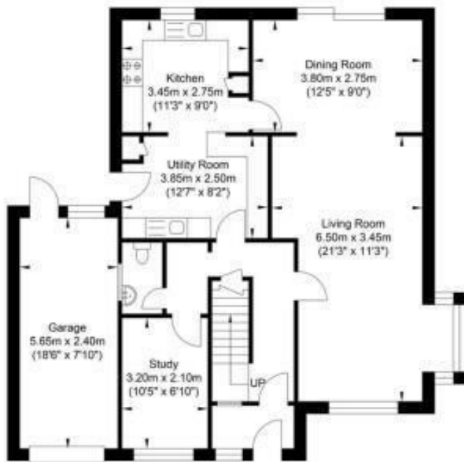
Ground Floor Approximate Floor Area 957.34 sq ft (88.94 sq m)