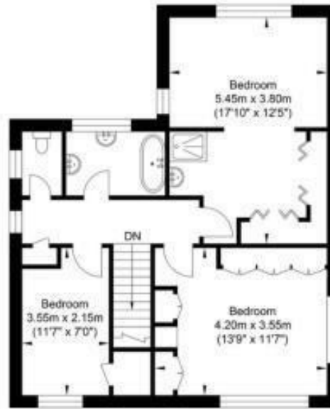
First Floor Approximate Floor Area 614.83 sq ft (57.12 sq m)

Approximate Gross Internal Area = 146.06 sq m / 1572.17 sq ft