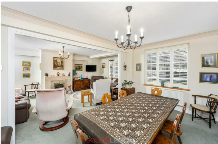
Furze Croft, Brighton