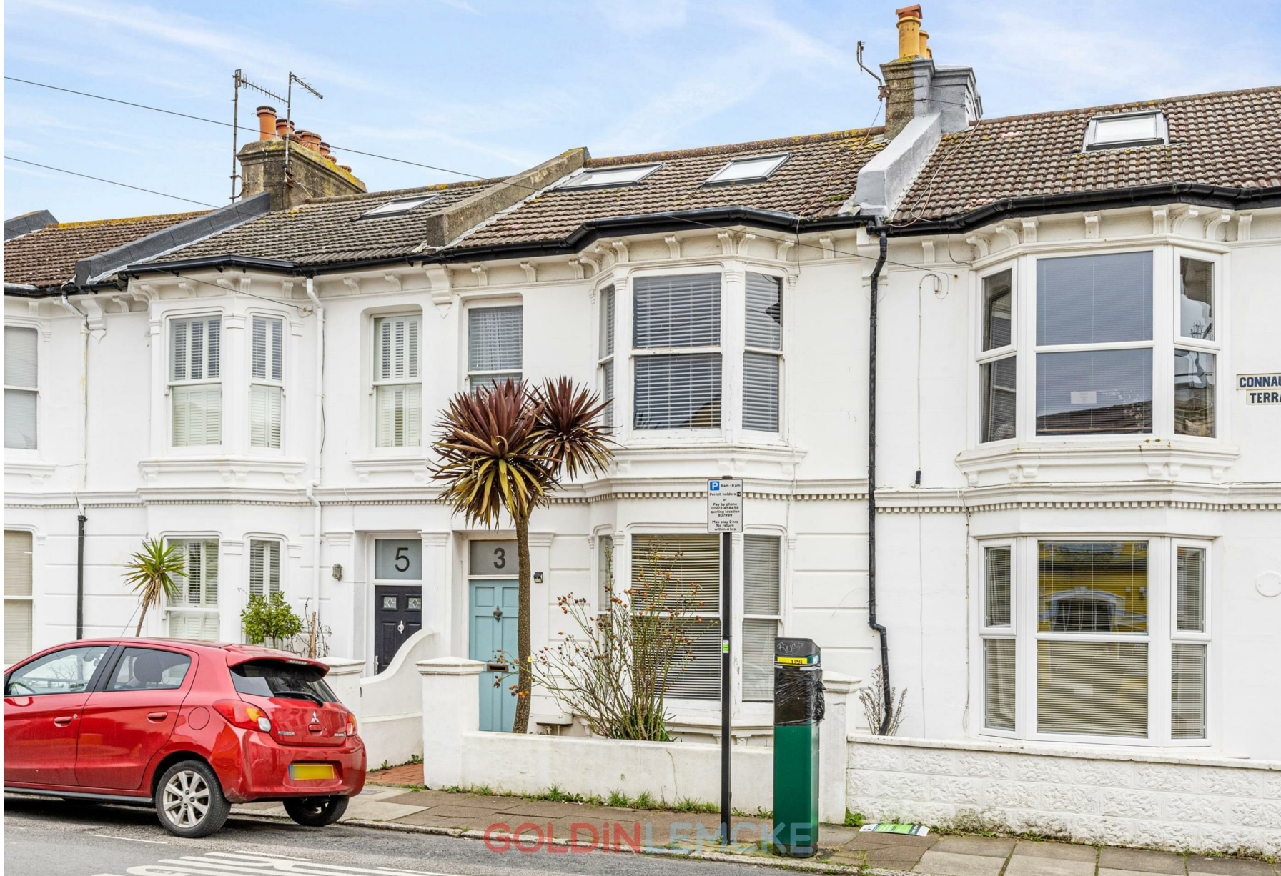
Connaught Terrace, Hove, BN3 3YW £650,000 - £675,000 Guide