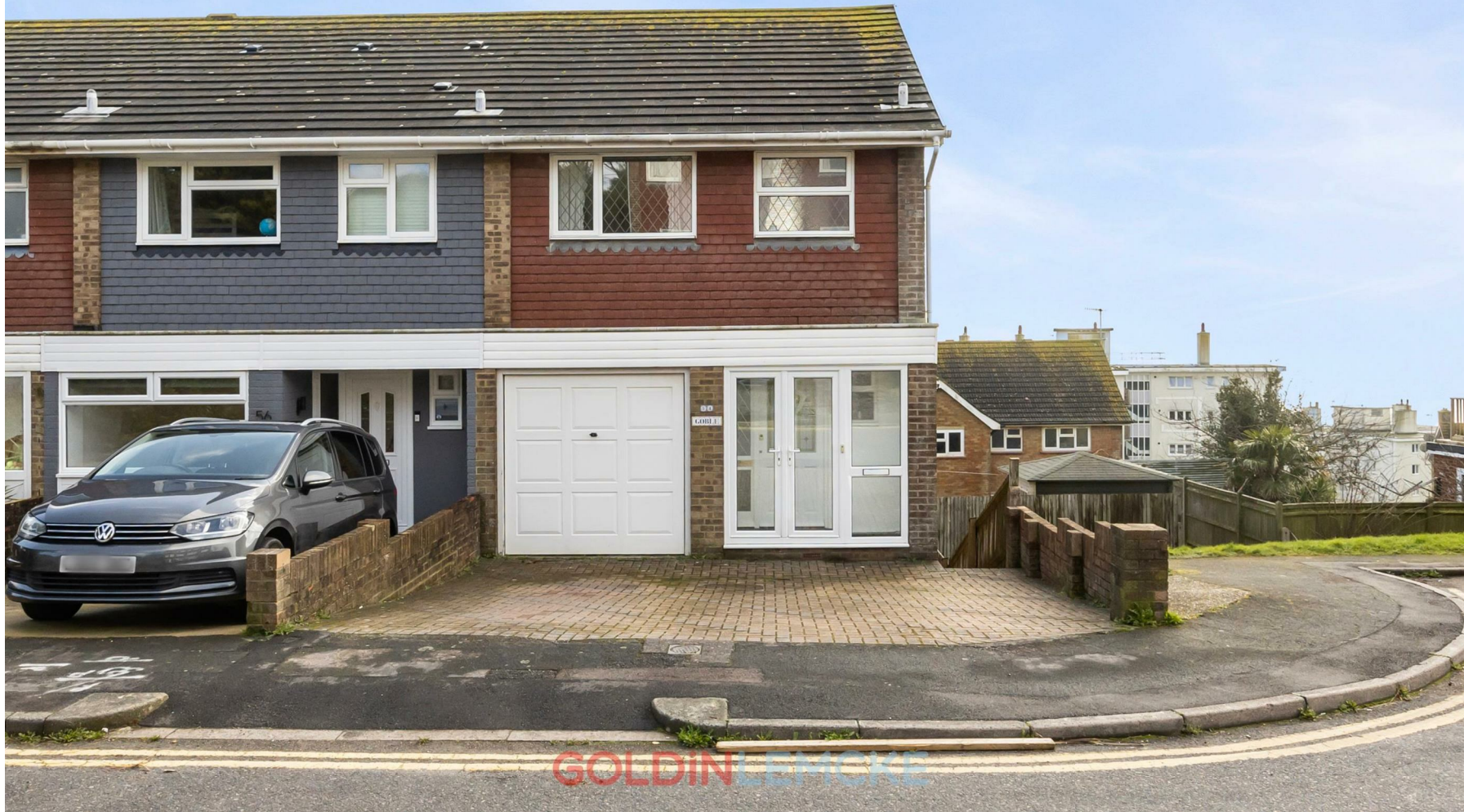
Slinfold Close, Brighton, BN2 0YS £550,000