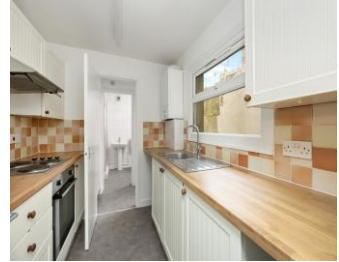
GFF , 24 Islingword Road Brighton, BN2 9SE