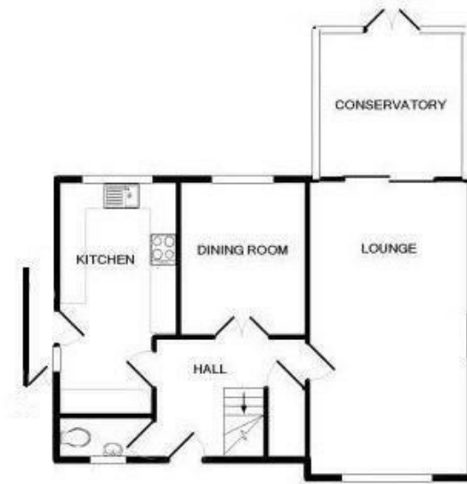
GROUND FLOOR APPROX. FLOOR AREA 592 SQ. FT. (55.0 SQ.M.)