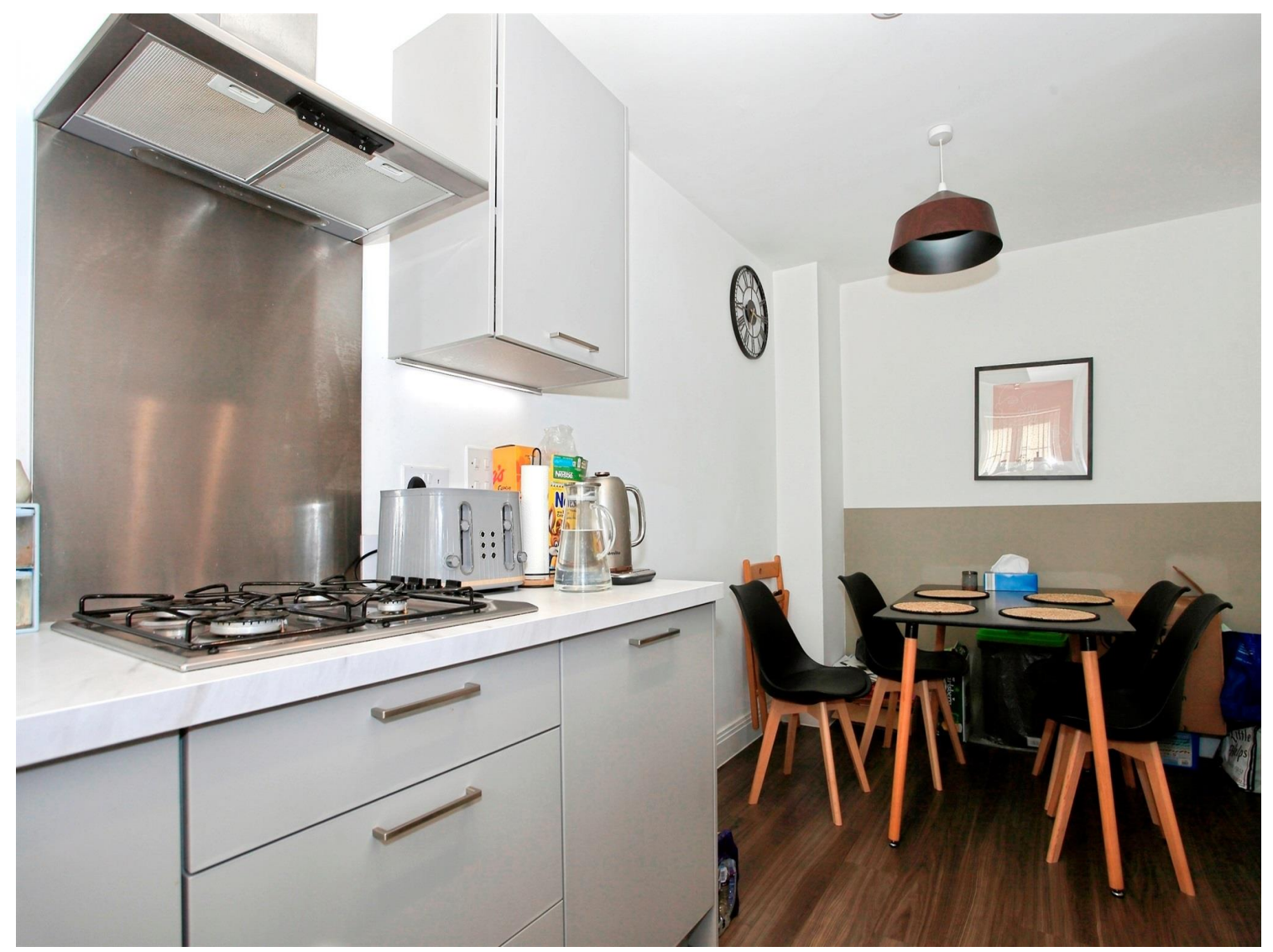
Hewitt Close Hampton Heights Peterborough PE7 8ST

This well presented property would make an ideal family home, be a perfect opportunity for a first time buyers or those looking to make an investment purchase. Offering three bedrooms with an en suite to the master, the property also benefits from a modern kitchen with fitted appliances.