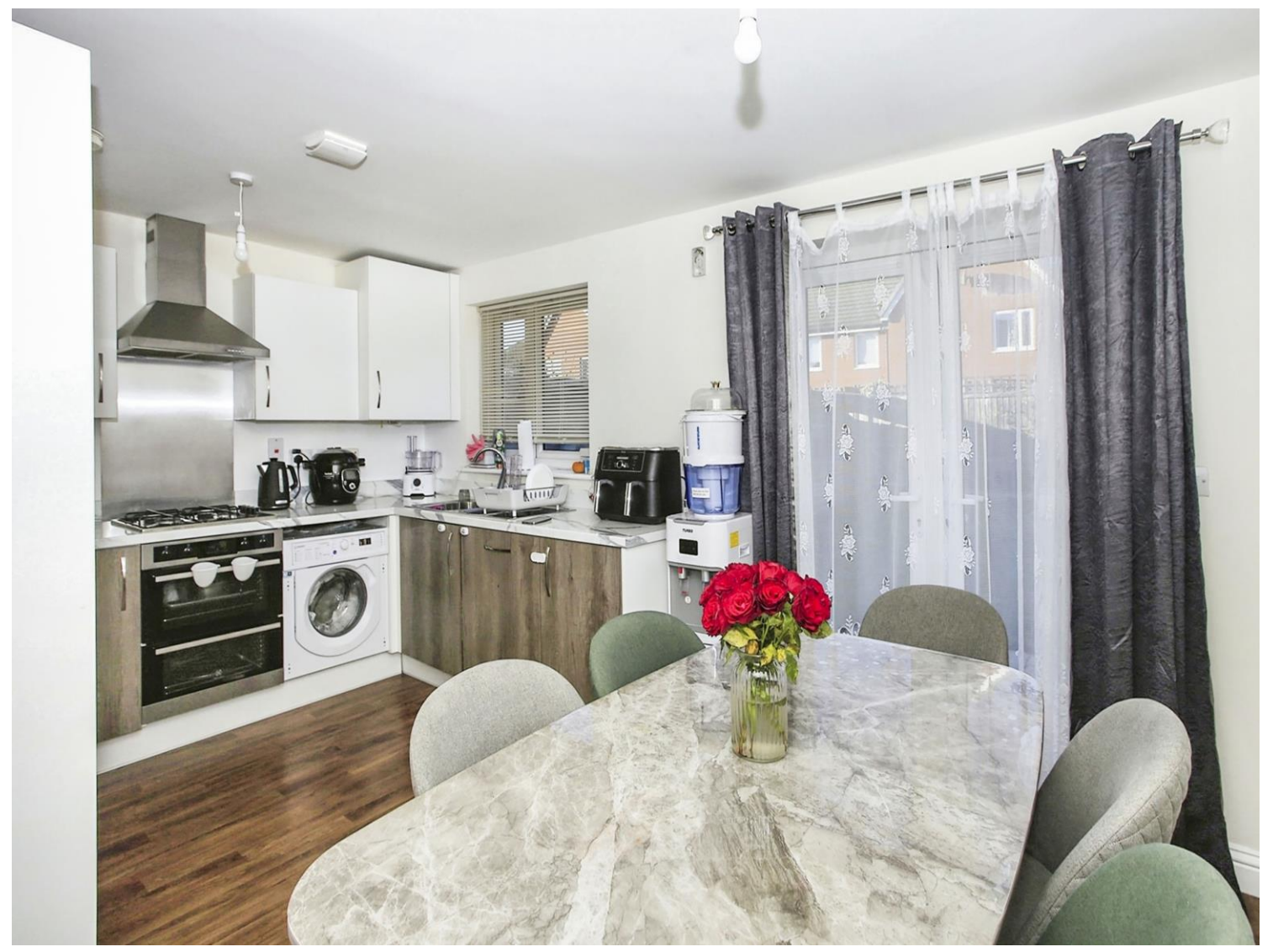
Brecken Court Hampton Centre Peterborough PE7 8PN

An ideal family home located in the popular Hampton Centre area. This semi-detached house offers a generous sized lounge, 3 bedrooms, rear garden, allocated parking and is finished to a high standard. Call 01733 229483 for more details and to arrange a viewing.