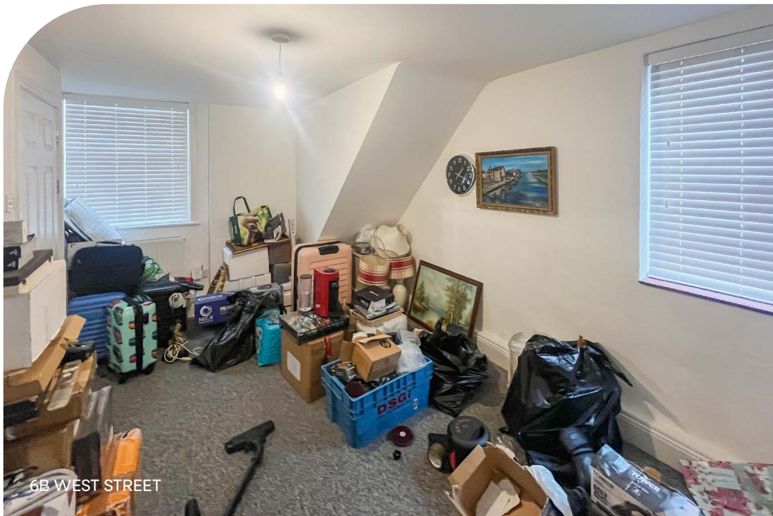
6B WEST STREET