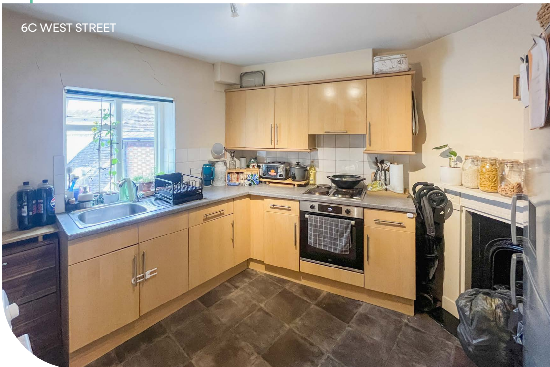
6C WEST STREET