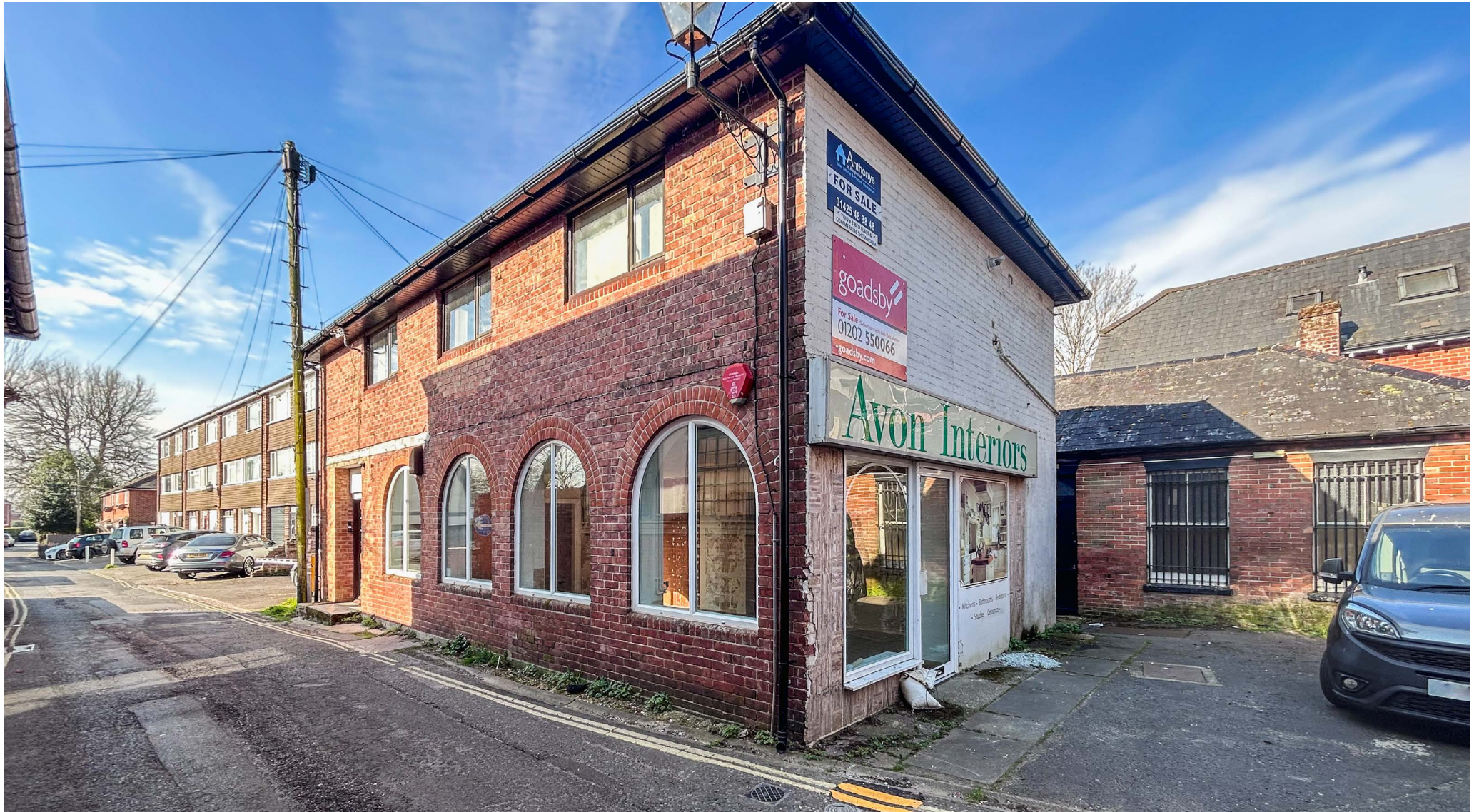
KINGS HOUSE, KINGS ARMS LANE, RINGWOOD, HAMPSHIRE, BH24 1AH