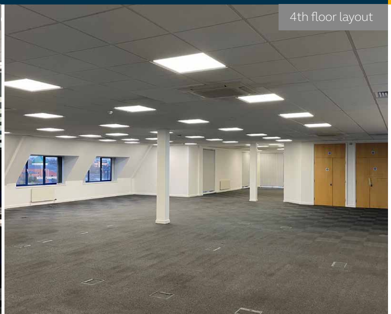
4th floor layout