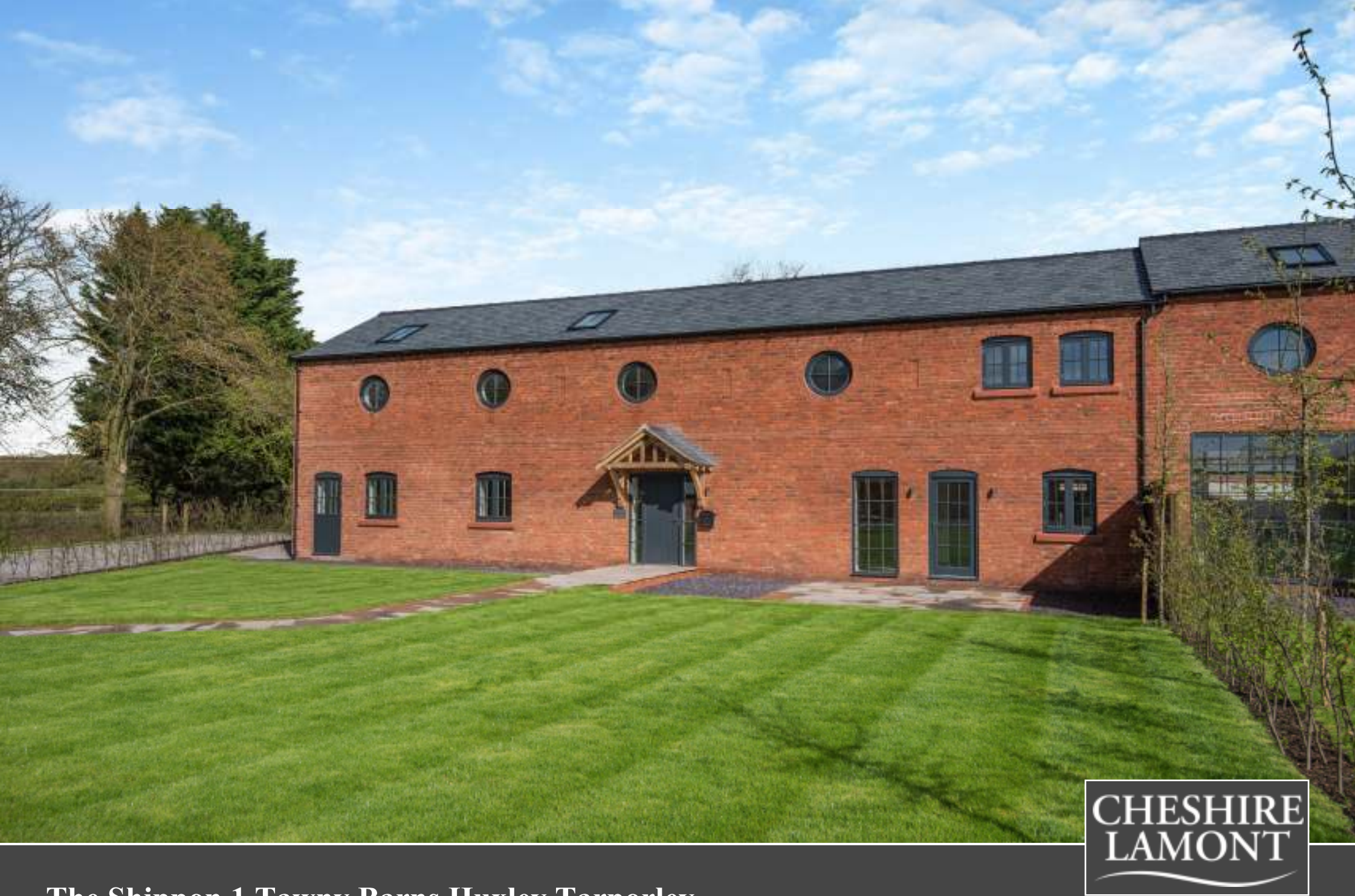
The Shippon 1 Tawny Barns Huxley Tarporley