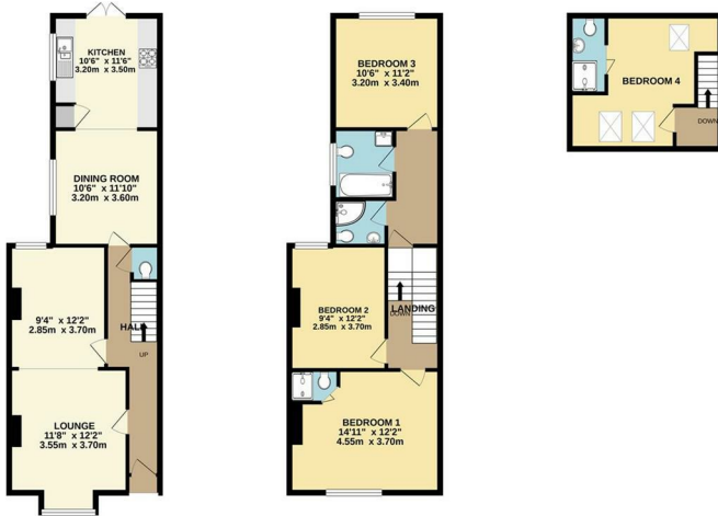
SECOND FLOOR 205 sq.ft. (19.1 sq.m.) approx.

TOTAL FLOOR AREA: 1471 sq.ft. (136.7 sq.m.) approx. While every attempt has been made to ensure the accuracy of the floorplan (containing floor measurements), all dimensions, rooms and plot areas are approximate and not responsible for any error or omission in this statement. This plan is for illustrative purposes only and should be used as such by any prospective purchaser. The accuracy, content and applicability of these plans has been checked and the purchaser as to their suitability or efficiency can be given. Made with Blueprints 12/22