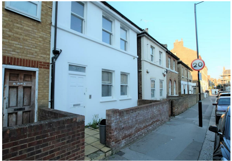
Mozart Street, London W10 £2,300 Per Month Furnished/unfurnished