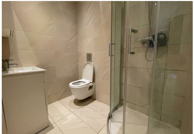
West Hampstead Mews, London, NW6 £1,850 Part furnished