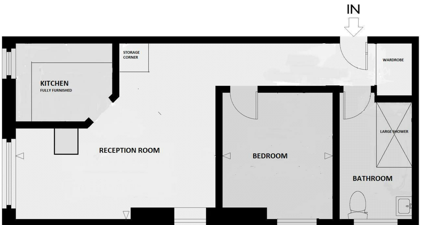
FLOOR PLAN FOR IDENTIFICATION PUPPOSE ONLY - 4TH FLOOR ADDISON HOUSE