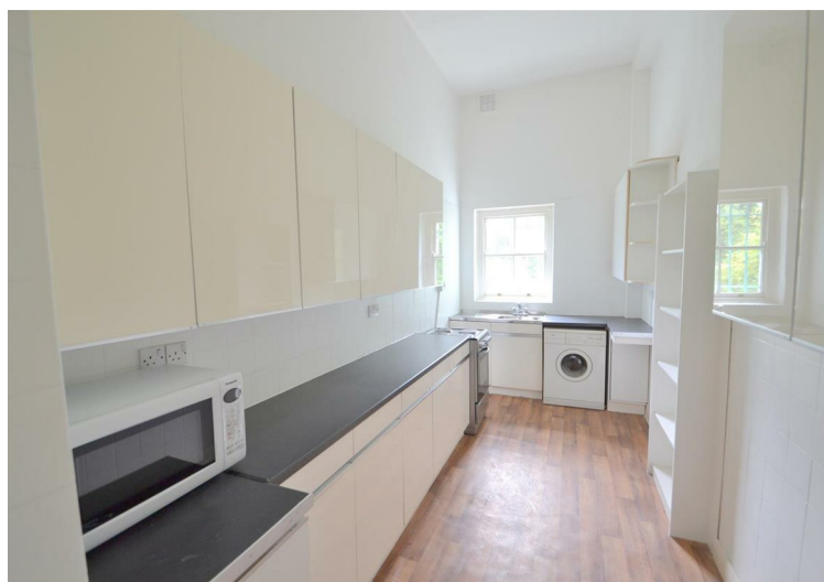
Hamilton Terrace, London £2,817 Per Month Furnished/unfurnished