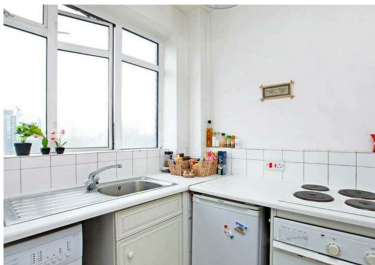
Warren Court, Euston, NW1 £2,470 Per Month Furnished