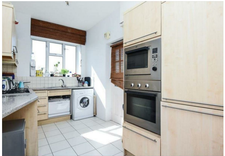
Wellington Road, St John's Wood, NW8 £3,336 Per Month Furnished