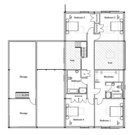
Proposed first floor