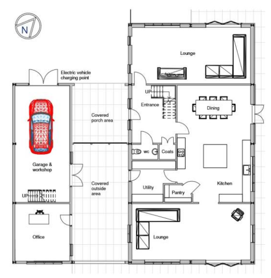
Proposed ground floor plan 1:100