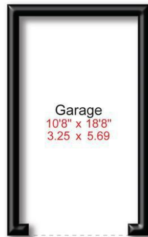
Garage 10'8" x 18'8" 3.25 x 5.69