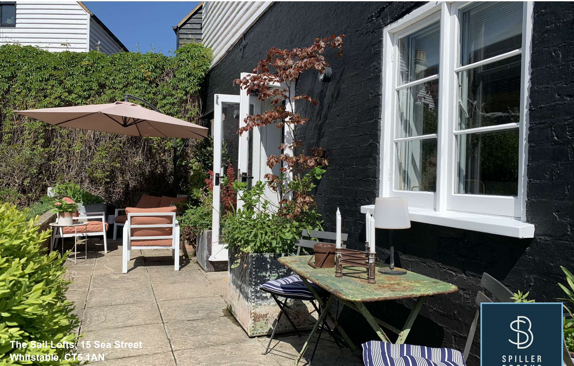
The Sail Lofts, 15 Sea Street Whitstable, CT5 1AN